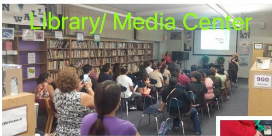
Library/ Media Center