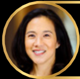
A Skype Conversation with Angela Duckworth Date: Wednesday, March 4

Aristotle defined character as the intentions and actions that benefit the individual and society at large. Character is not one thing—it's many. In this talk, Character Lab Founder and CEO Angela Duckworth explains the importance of three different kinds of character strengths: Interpersonal strengths like gratitude enable harmonious relationships with other people. Intrapersonal strengths like grit and self-control enable achievement. Intellectual strengths like curiosity enable a fertile and free life of the mind. To develop any of these character strengths requires motivation, skill, and opportunity. Using grit as a case study, Duckworth shows how young people can learn both.