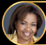
General Session 2 The "Amazing" Tei Street Date: Thursday, March 5

The "Amazing" Tei Street will share what is possible when we remove the masks of pretense to create authentically inclusive climates and cultures in schools. Tei has more than 25 years of experience in higher education, curriculum development, training in sexual assault prevention, domestic violence prevention, diversity, inclusion, as well as advocacy, education and youth leadership development.