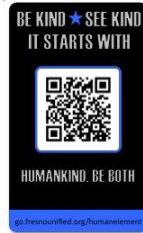
FRONT with out sticky