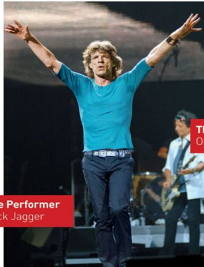
The Performer Mick Jagger

WE ASKED AMY CUDDY TO DESCRIBE FOUR CLASSIC POWER POSES: