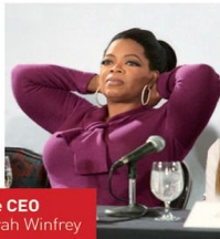
The CEO Oprah Winfrey

"This is a classic expression of feeling powerful in the moment—it causes you to physically expand."