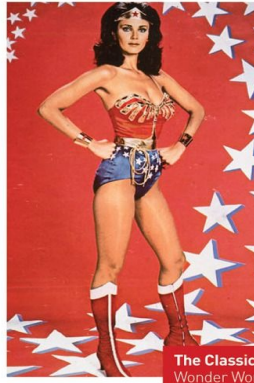
The Classic Wonder Woman

"The body language naturally projects dominance. It's unusual to see a woman in this position."