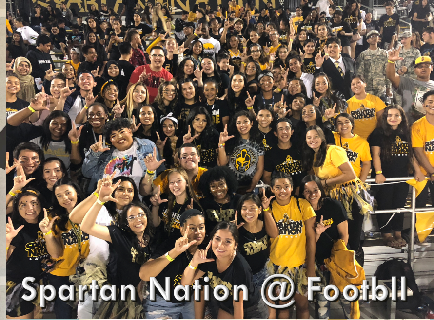
Spartan Nation @ Football