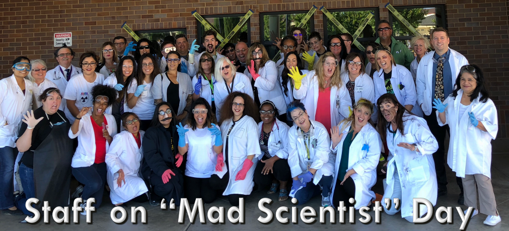
Staff on "Mad Scientist" Day