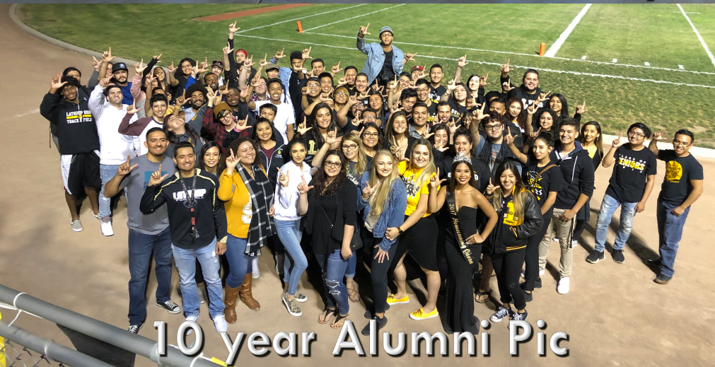
10 year Alumni Pic