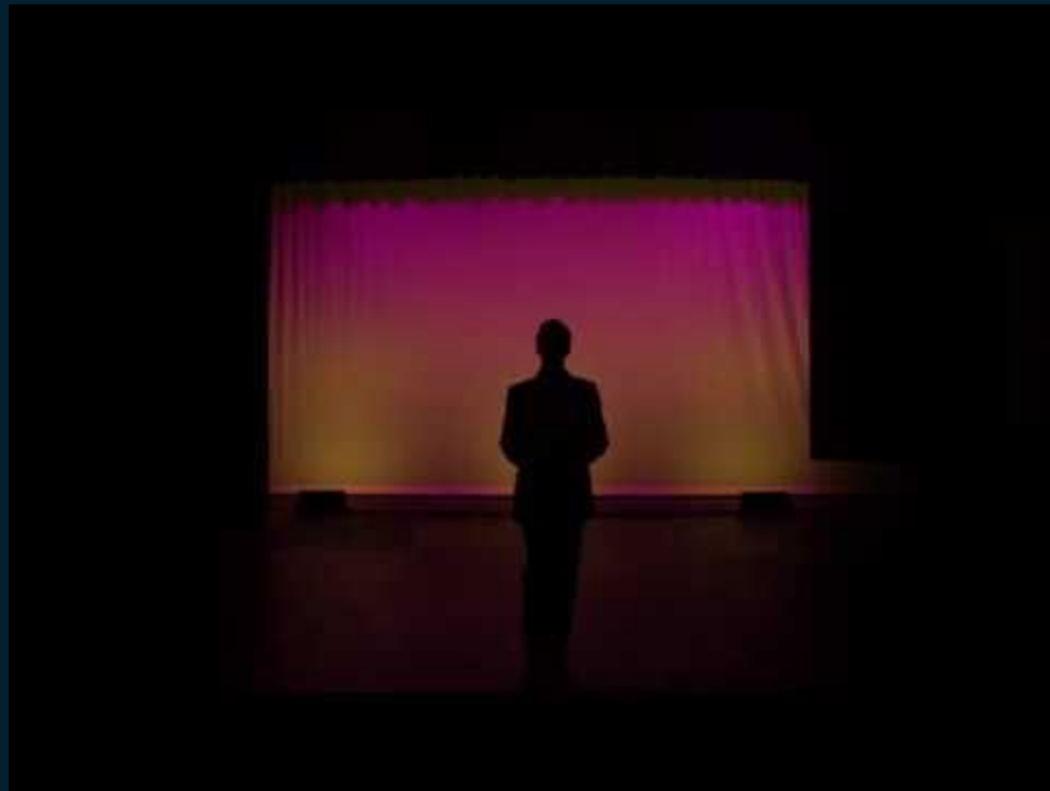
Clip of Final Product