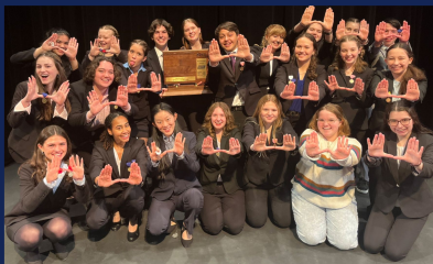
Speech State Send Off