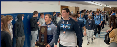
Wrestling State Send Off