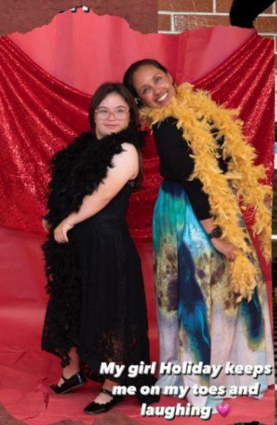
My girl Holiday keeps me on my toes and laughing💖