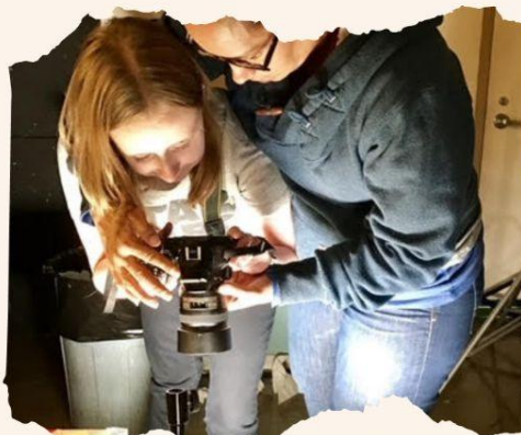
Orange County Arts and Disabilities