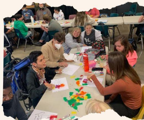
Care Club or Best Buddies