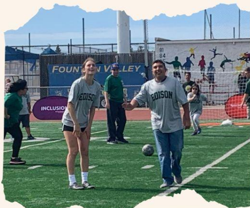
Unified Sports - Special Olympics